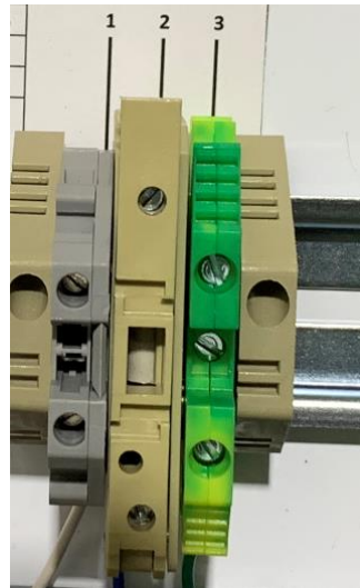
Left-Side Terminal Blocks Accepts 12-26 AWG Wire